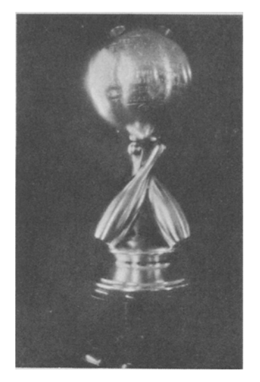
American Oil Chemists' Championship Trophy, won by Swift Premium Team.